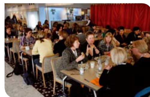
During the Amgen-sponsored lunch the nurses were engaged in lively discussions

Aside from contributions to the EUT Newsletter, national societies have also been actively involved in new international nursing advisory boards. The advisory boards provide, in collaboration with health care affiliated groups, proactive knowledge exchange on certain topics in urology nursing care. Having realised the importance of such promotional activities, we will continue to build up communication and information platforms that effectively connect the members of national societies with the EAUN and other pan-regional associations of urology nursing.